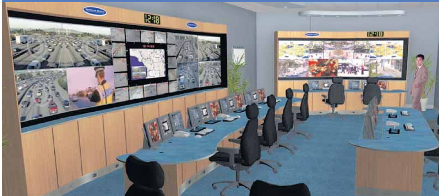
An artist's impression of the new control centre.

Sandwell Homes is investing £2.2million in a new state-of-the-art CCTV system and control centre to ensure the continued safety and security of residents and tenants across the borough.