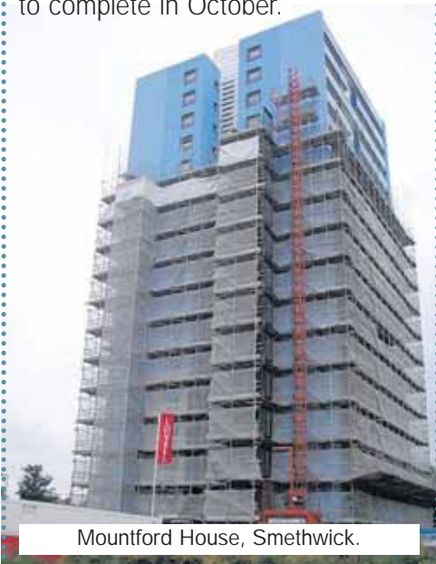
Mountford House, Smethwick.

This project will see four eight-story blocks benefit from the replacement of broken glass panels to balconies, new entrance lobbies, repair to concrete and brickwork, a new roof covering, decoration of internal communal areas, new front doors, and new aluminium timber composite windows and balcony doors. At a cost of approximately £5 million this significant project is expected to complete in October.