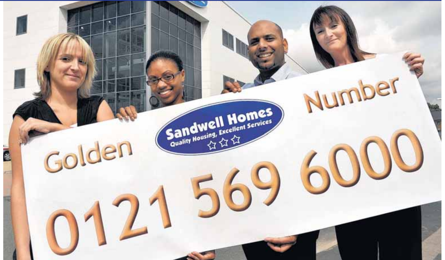
Members of the customer services team promote the new 'Golden Number'.

The closing date for applications is Friday 25 September.