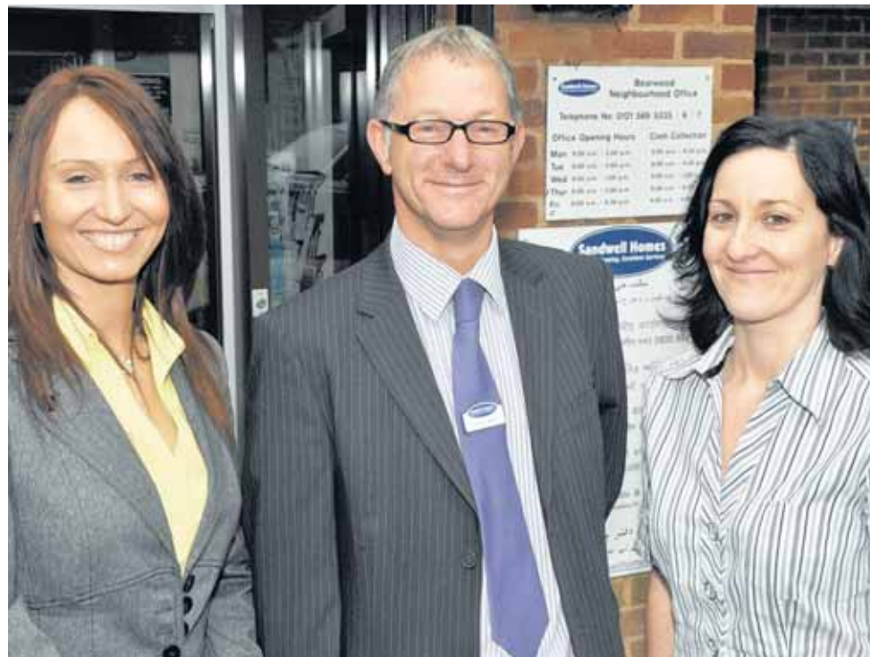
Three members of the award-winning financial inclusion team.

Sandwell Council has set up this group to provide advice to those affected by financial problems and money worries. Further information on a wide range of issues can be obtained via their website www.tacklingdebtinsandwell.co.uk